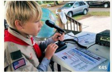
Special event station K4S in Jasper, Tennessee, 2018 photo; Radio Scouting.

It is now the 81st most popular Merit Badge, up from being 98th in 2021. Trailing just behind it on the biggest gains list is the Electronics Merit Badge, which jumped 15 spots, from 80th to 65th. To earn the rank of Eagle Scout, members must earn 21 badges, 14 of which are standard. The Scout gets to choose the remaining badges based on personal interests.